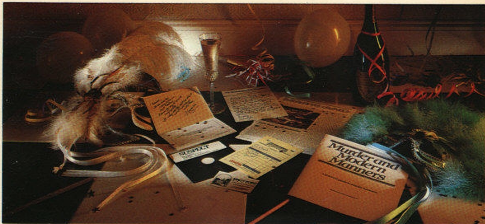
Cleverly disguised within every SUSPECT package: your SUSPECT disk; the best-selling book Murder and Modern Manners ; a clue-laden business card; costume receipt; party invitation; a note from your editor, and an article from the exclusive magazine, The Maryland Countryside .